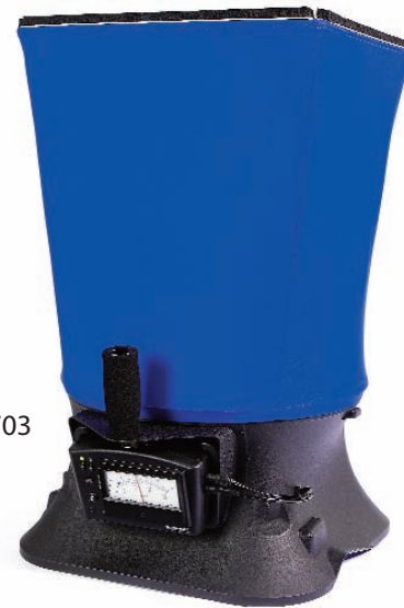
Model ABT703 and ABT713