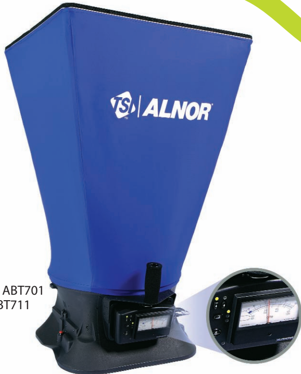
Model ABT701 and ABT711